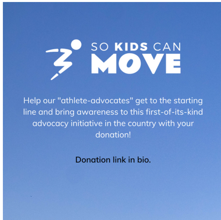
Call to Action